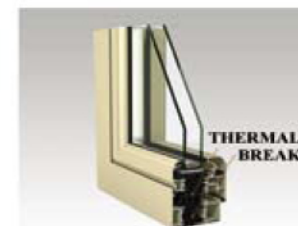
ALUMINIUM WITH THERMAL BREAK

Call SAFESTYLESPAIN now on 96 646 2830 and put us to the test!