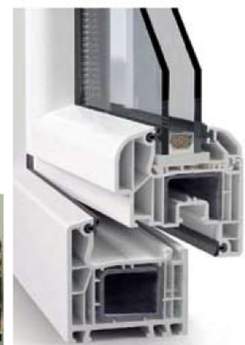
5 CHAMBER UPVC FRAME